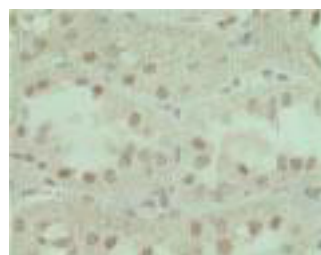
Rat Kidney Renal tubules paraffin section