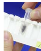
Fig. 3 Magnetic separation