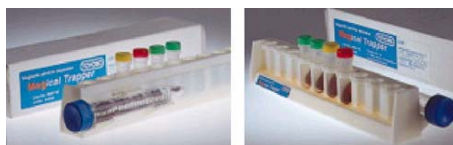
Fig.2 Magnetic stand Magical Trapper (Code No.MGS-101)