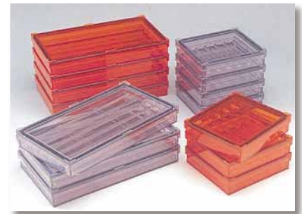
Multi-Purpose Incubation Chamber Large (for 20 sheets) 345 x 195 x 48 mm Small (for 10 sheets) 195 x 172 x 48 mm