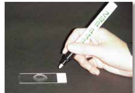
maximam temprature 120°C