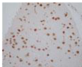
Rat Cerebrum Nerve cell paraffin section