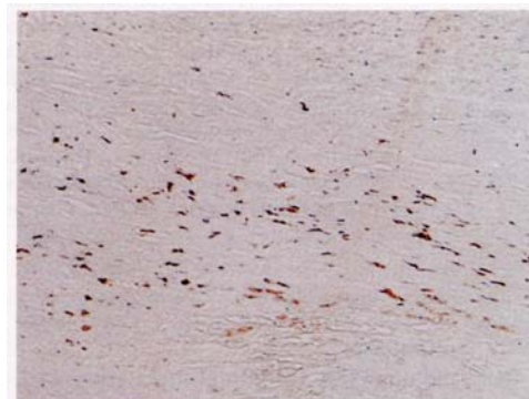
Immunohistochemical staining of the early stage of human atherosclerotic lesions of the aorta with anti-AGEs antibody 6D12.

Clinical nephrology , Vol.42, 354-361, 1994