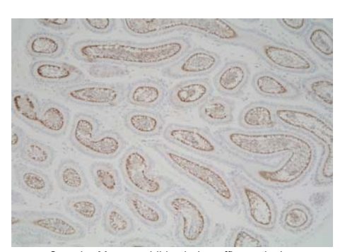
Sample : Mouse epididymis (paraffin section)