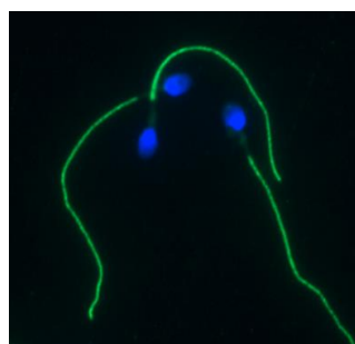
Immunofluorescence of human spermatozoa